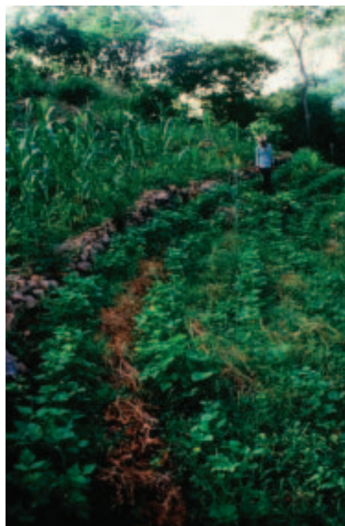
Polyculture contributes to conservation and biodiversity.

An example of an integrated approach would be addressing the large difference between maize yield achieved by very poor farmers and the potential yield of the crop, mainly due to soil infertility and poor access to agricultural inputs through: 1) use of improved fallows to rehabilitate degraded farmland and increase maize yields 1-4 tonnes per hectare by