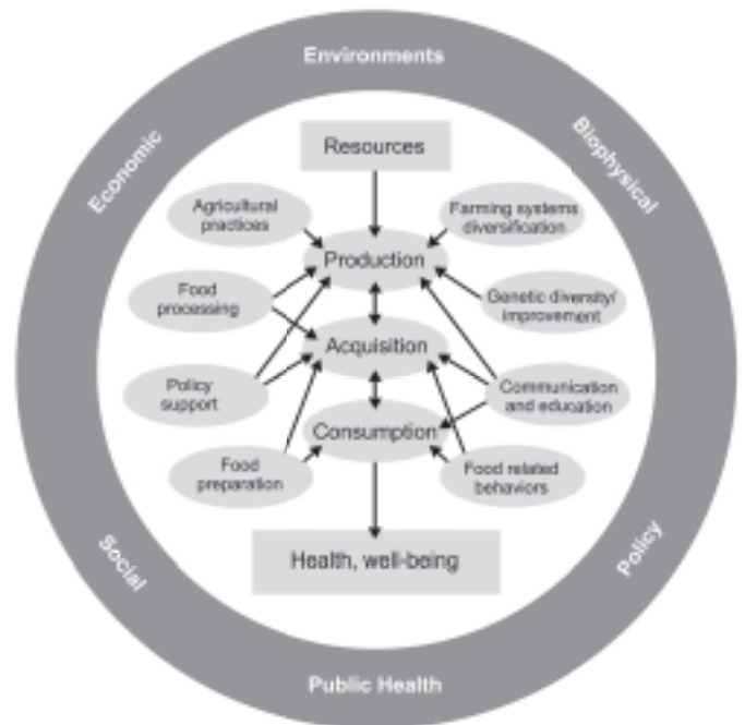
Holistic food system model. Source: Combs et al., 1996

Reduced tillage and conservation agriculture (currently practiced on 5% of cultivated land, hence