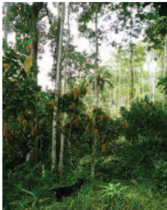
Cocoa under Cordia alliodora in Costa Rica.