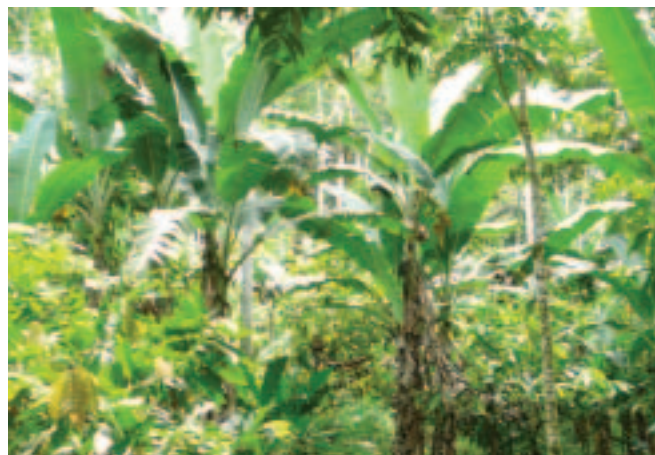
Mixed cropping for multiple benefits.